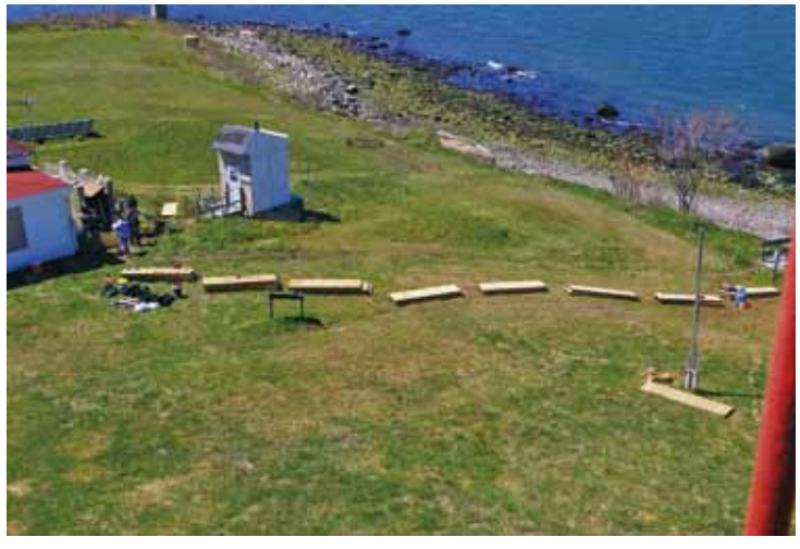
Scouts place new walkway between the stairs and the bunk house

and replaced all the lost tern boxes with assistance from students at Connecticut College, the New London Science and Technology Magnet High School and staff from the National Audubon Society. The blinds were repaired