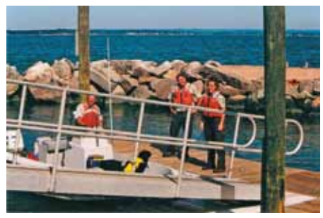
Fish and Wildlife Service crew