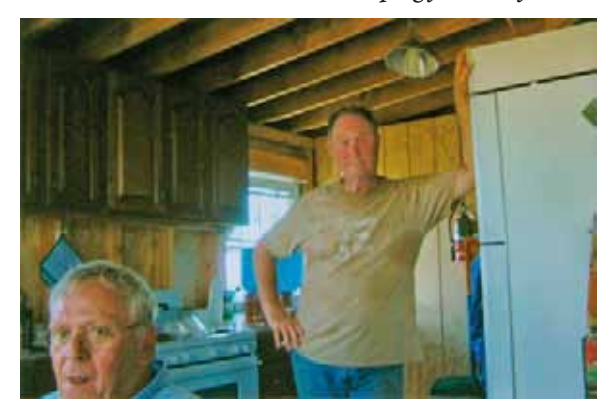
New kitchen facilities