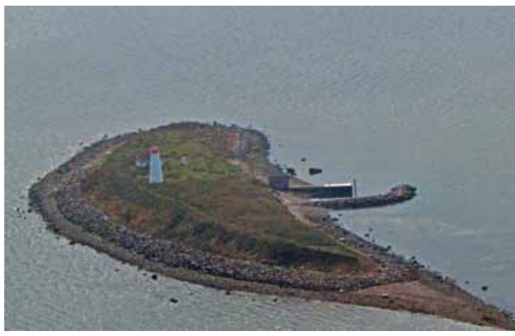
Aerial views of Faulkner's Island post Hurricane Irene

At first glance, Faulkner Island seemed to have weathered the autumn storm well, but closer examination revealed substantial damage to the island's boat basin, shoreline, and some areas of the revetment, undermining the protection it offers. The force of the waves also toppled a section of the breakwater which protects the boat basin. Four and five ton stones were overturned and rolled into the boat basin. This decreased the size and area where it is safe to navigate watercraft. This damage particularly effects the safe operations of large boats entering the basin on low tides. Also, the concrete portion of the pier was severely undermined which created a void completely through the pier measuring approximately 8ft wide and 5ft tall.