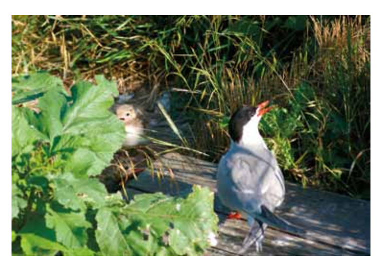
Mom and newly hatched chick.