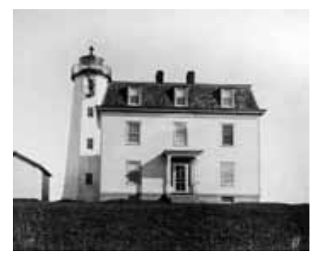
The light & lightkeepers house before the fire.

In March 1976, a fire broke out in the light keeper's house while two Coast Guardsmen were on duty. Fire fighters couldn't get out to island quick enough so the 1871 light keeper's quarters was completely destroyed