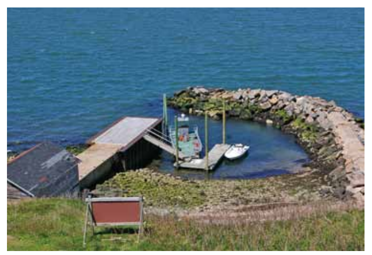
New pilings were placed in the basin in April 2012

by the boy scouts and scout leaders from Hebron, and help in preparing the island for the terns was provided by students from the Sound School (Junior Brigade) and Westbrook High School. Additionally, an Eagle Scout project was launched to construct new boardwalks to facilitate the movement of staff and volunteers around the island during nesting season. Finally a generous contribution from Faulkner's Island Light Brigade allowed the