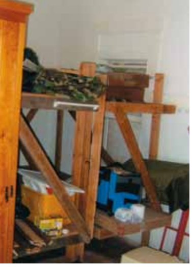
Sleeping facilities for interns

What use to be a one room building, the Generator Building was expanded to house the USFWS interns who study the terns throughout the summer. The expanded facility provides better space for working, cooking and lodging.