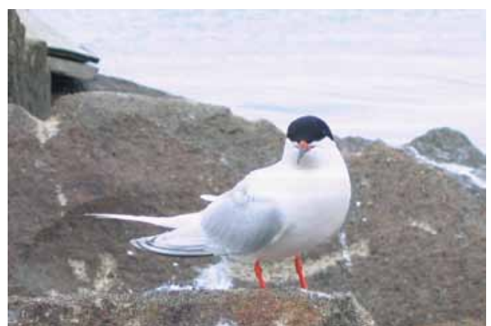
Common Tern Faulkner's Island June 2012