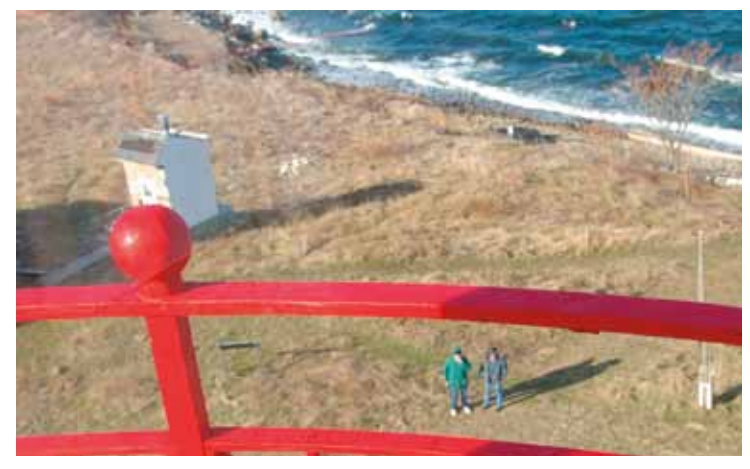
Russ Sanotoro and Steve Syoc take one last look at the completed restoration, March 2011

The restoration started in October 2010 and included power washing with fresh water transported to the island, repointing the interior and exterior, the application of an all-white breathable coating to make the tower weather tight, painting of the lantern gallery, installation of ventilated stainless steel doors, repair of the 12-pane casement windows in the face of the west wall and restoration of the original weathervane. The restoration work was suspended in December 2010 due to foul weather and was finished at the end of March 2011. Total cost was $121,000 and it was completely supported by the generous contributions of our members.