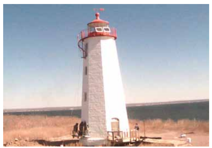
ICC reinstalled the remodeled front door, March 2011