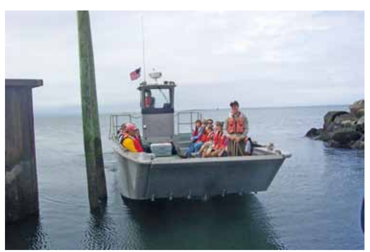
Visitors arriving for Open House visit

And what better way to end the historic event than a dramatic 23 minutes of fireworks shot over the town harbor