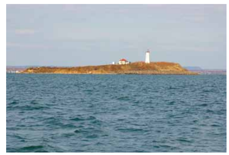
New stone revetment and resloped eastern bluff completed in 2001

The erosion project was a unique engineering accomplishment with major problems and disasters. A floating wharf was built of heavy barges, held in position by giant mechanically driven steel posts. Heavy equipment, trucks, bulldozers, cranes were brought in. A temporary road was built across the island to the eastern bluff, the site of the erosion. A ramp was made for trucks that brought the stone and other materials used to shore up the eroding bluff.