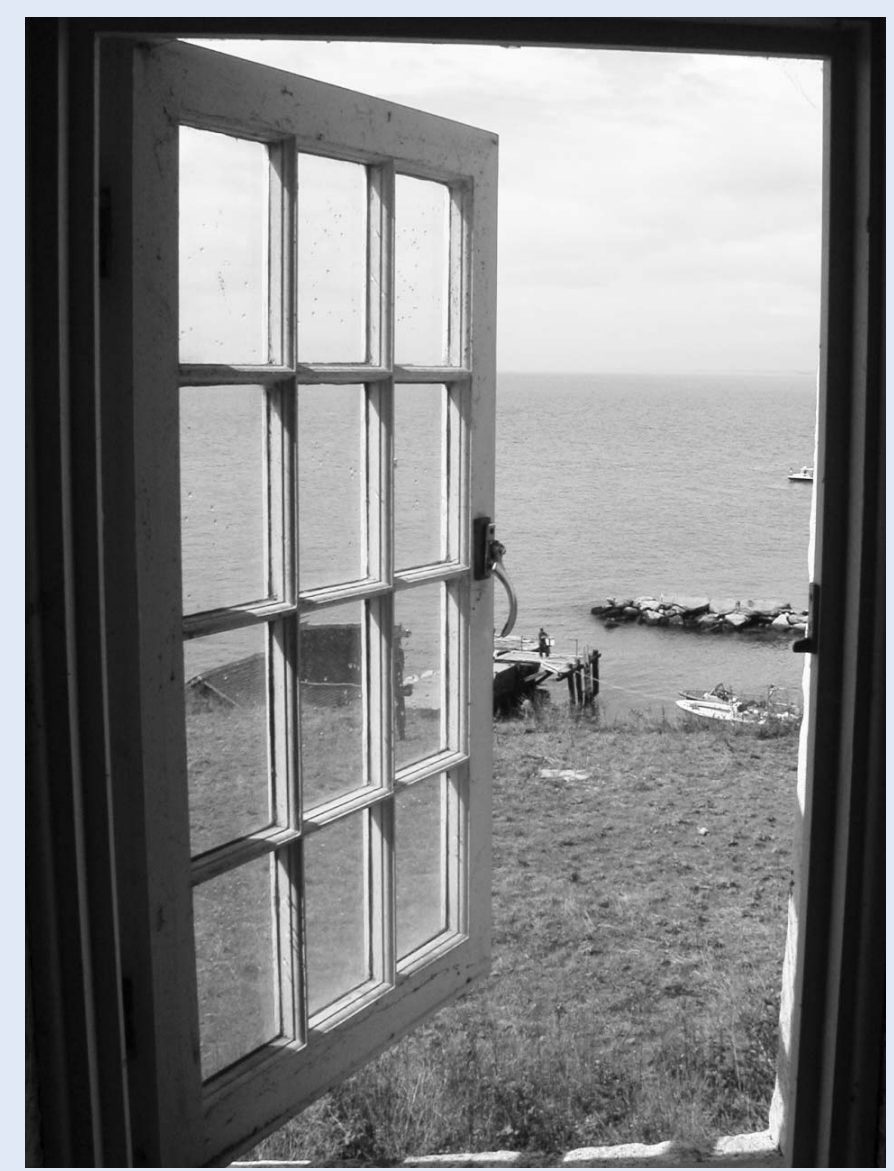
View from Lighthouse window.